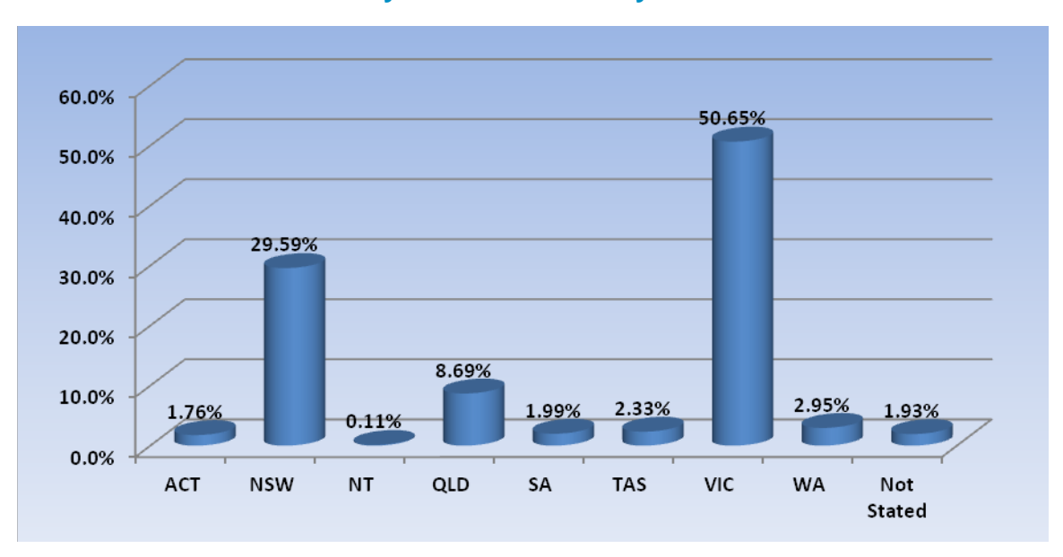
% By state and territory